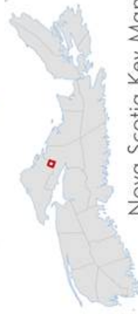
Nova Scotia Key Map

Map produced by the Protected Areas Branch of NS Environment, February 2013. For more information please visit www.gov.ns.ca/foe/proteaa/index.htm